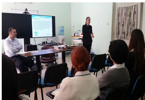
Allied Health Talk in Gozo - April 2016